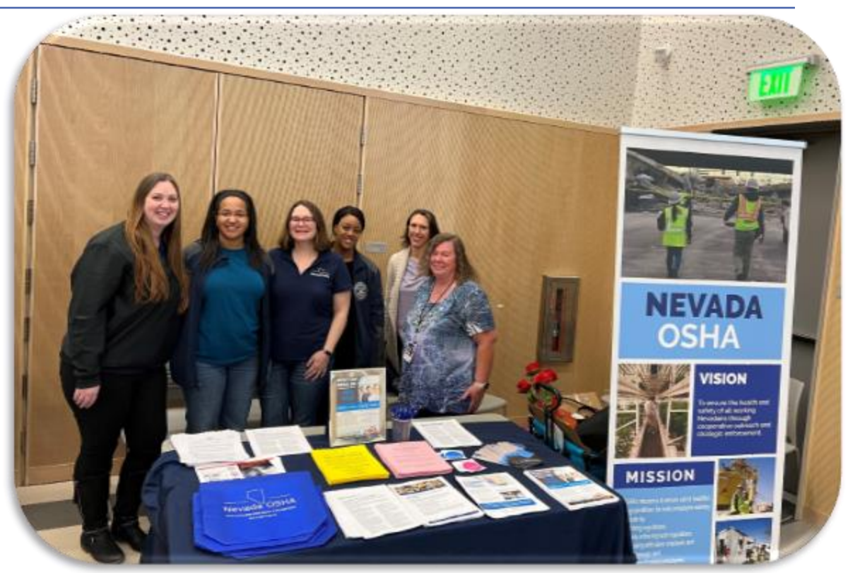
Hammers\ for\ Hope-3/6/2023 Serving formerly incarcerated women entering the construction field.