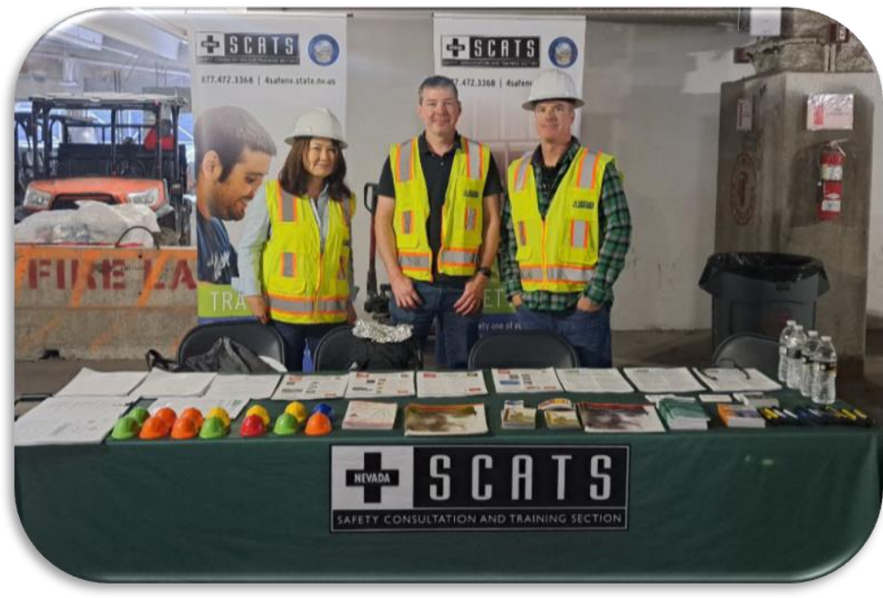
Safety week at the Fontainebleau Las Vegas – 5/4/23