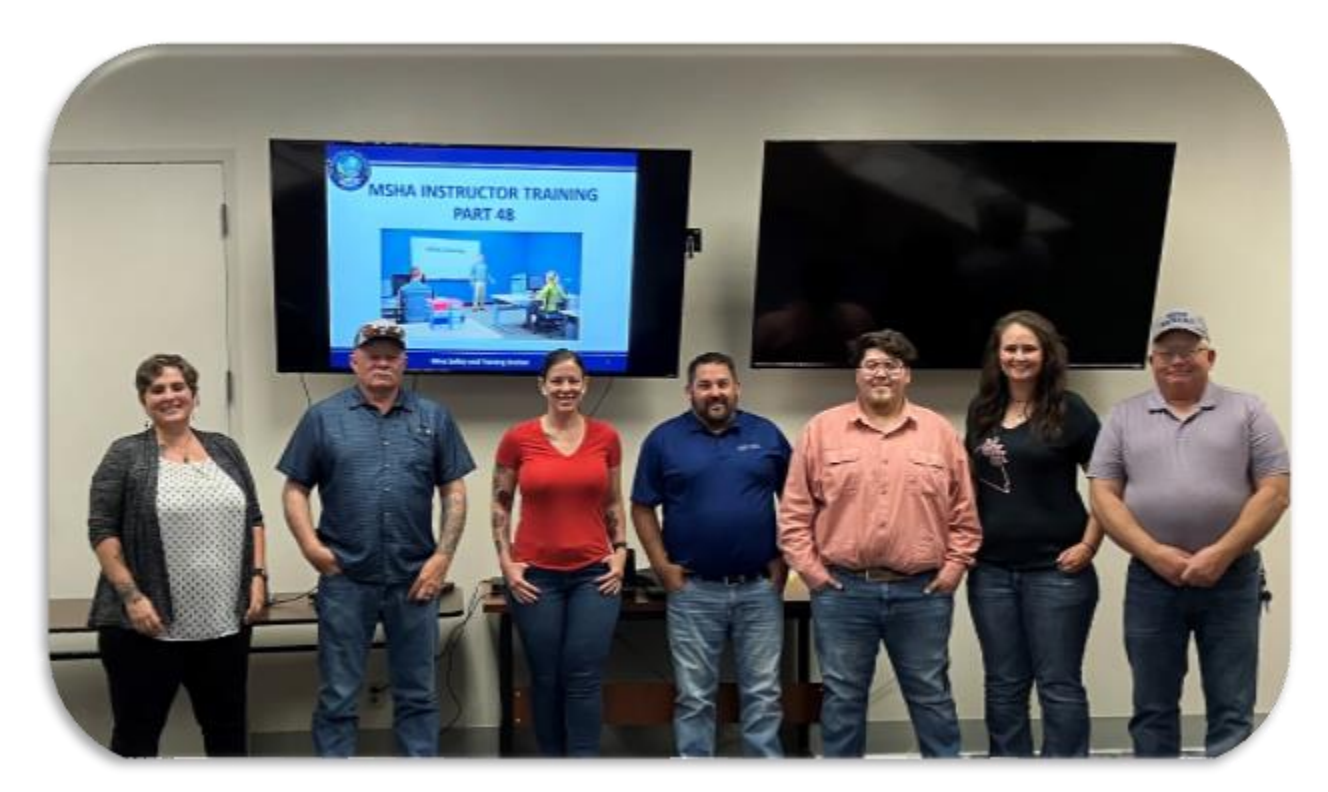
MSATS Train-the-Trainer Class 6-15-23